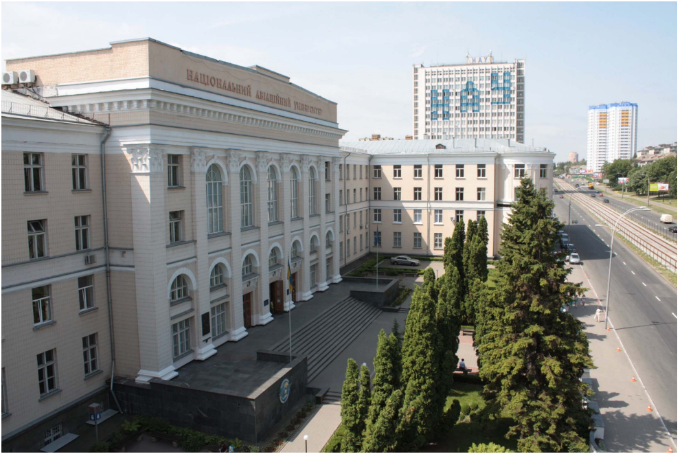
National Aviation University