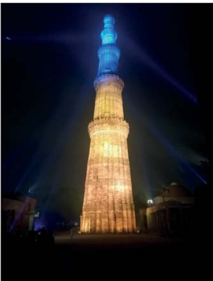
Вежа Кутуб Мінар, Індія. 24.08.2021