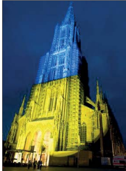
Ульмський собор із 160-метровою дзвіницею, Німеччина. 25.02.2022