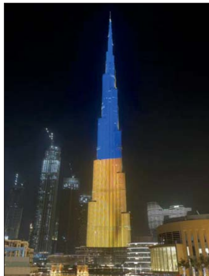
Бурдж-Халіфа, ОАЕ, найвища будівля світу. 24.08.2021