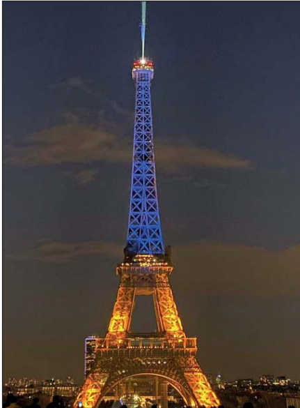
Ейфелева вежа, Париж, Франція. 25.02.2022