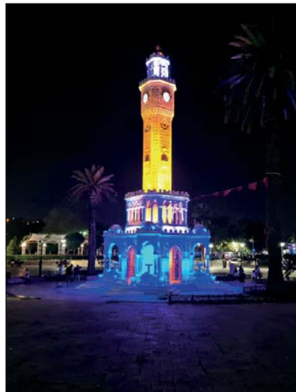
Ізмірська вежа з годинником, Туреччина. 24.08.2021