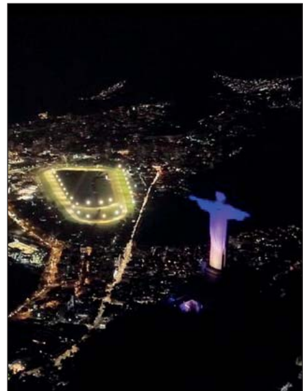
Пам'ятник Христу-Спасителю, Ріо-де-Жанейро, Бразилія. 24.08.2021