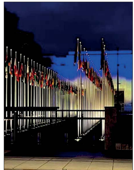
Палац Націй, Відділення ООН у Женеві, Швейцарія. 24.08.2021